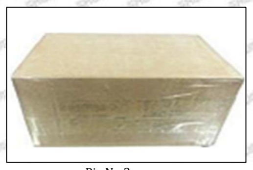
Pic No.2 Domestic express packaging: Wrapped by Transparent tape

Minors are prohibited from using transparent tape, yellow tape, black wrapping protective film, and white wrapping protective film to avoid personal injury.